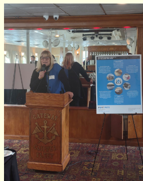
PortPitt Legislative cruise aboard the Gateway Clipper Fleet, October 13, 2022